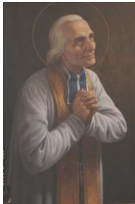
Painting: Mundelein Seminary, Mundelein, ILL.

“Christ, by rising to new life, has taught us ‘that evil never has the last word, that love is stronger than death, and that our future, and the future of all humanity, lies in the hands of a faithful and provident God.’ In every time and place the Church is called to proclaim this message of hope and to confirm its truth by her practical witness of holiness and charity.”